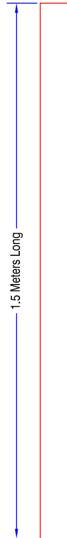
PVC Tubing 1/2" x 11/16 PN 060002